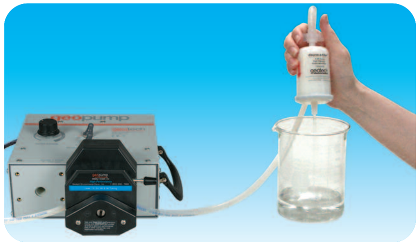
Sample collection with the Geopump™ Peristaltic Pump Series II with optional easy-load II® pump head (dispos-a-filter™ capsule sold separately)