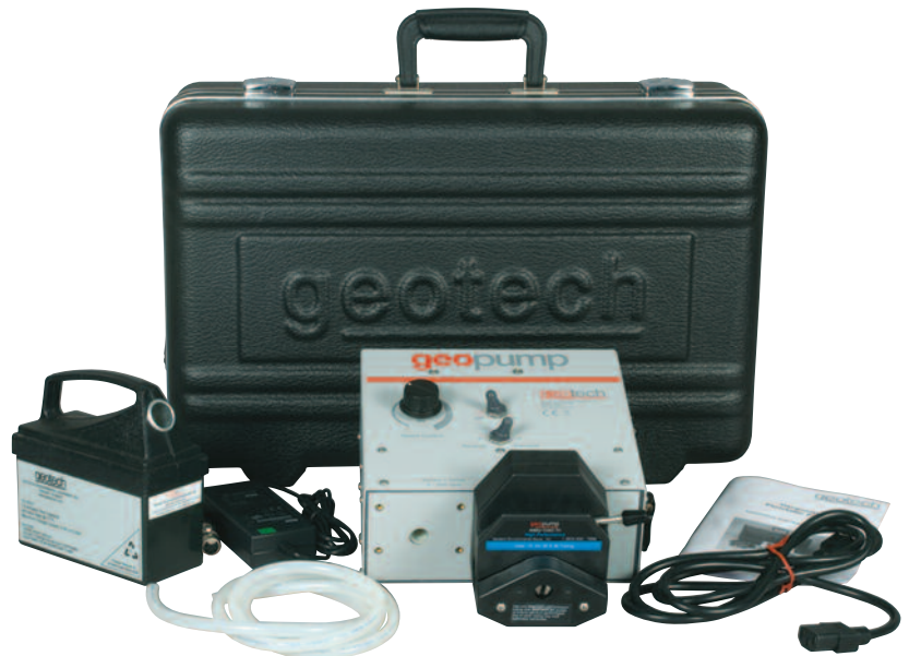
Geopump™ Peristaltic Pump Series II Kit with optional easy-load II® pump head, modular battery, 5 ft. (1.5 m) tubing, carrying case and power cord